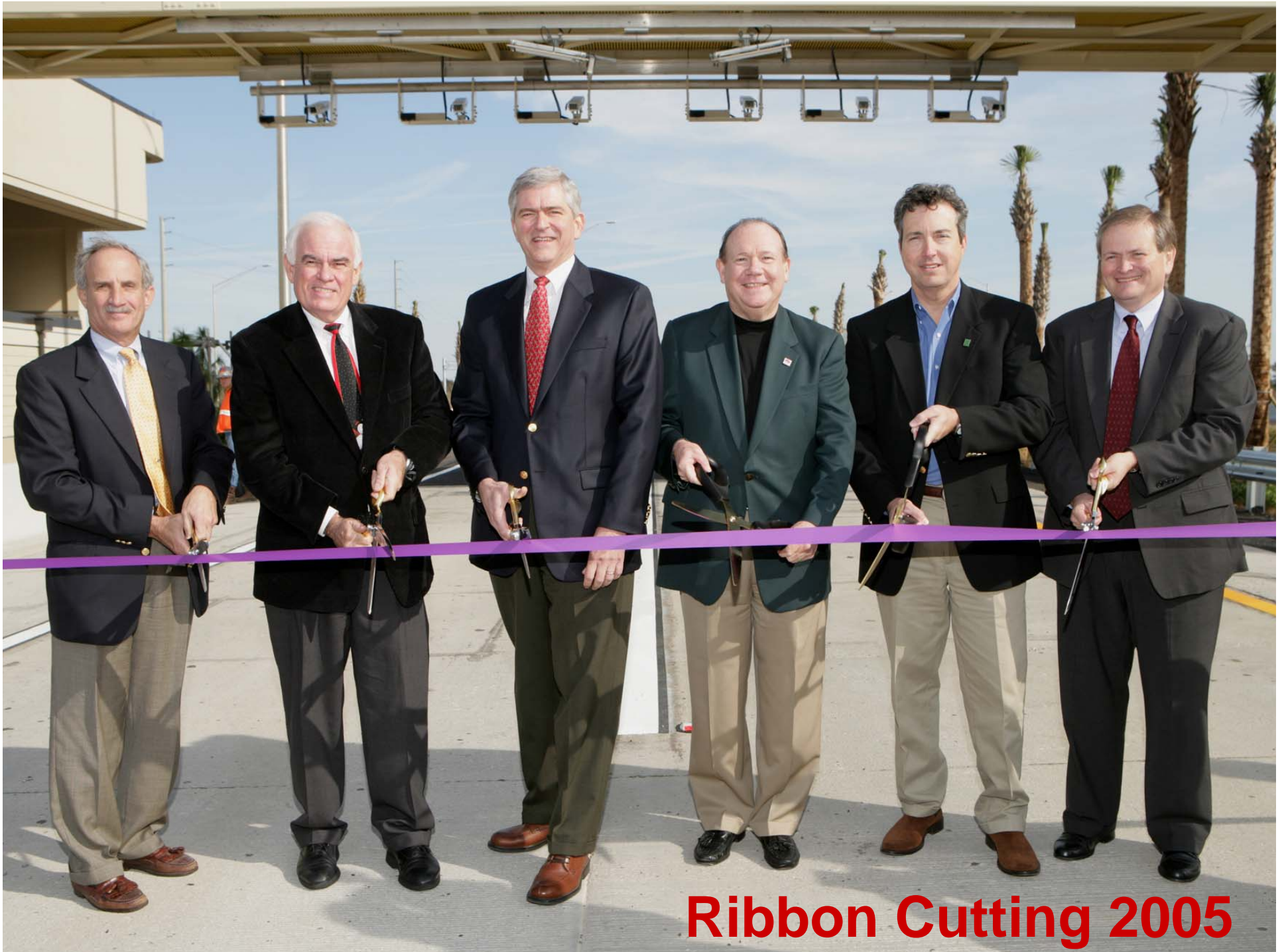
Ribbon Cutting 2005