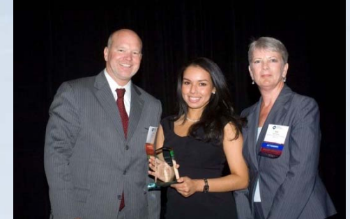
FDOT received 2010 ITS America Award for Best Innovative Project for 95 Express.